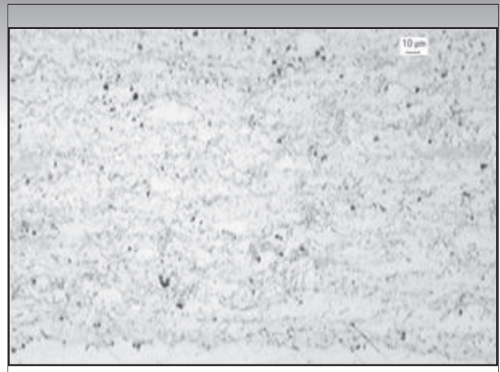
Above: JK®135 coating microstructure as obtained using Parameter Set D